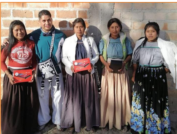
Jewish teens in Ocotlán Jalisco with tablets and coats from the VJM

“By promoting our activities on social media using Instagram and Facebook , the VJM received a donation that helped us to fund a prosthetic eye for a child in the Mexican children’s hospital. This was very emotional and satisfying achievement.”